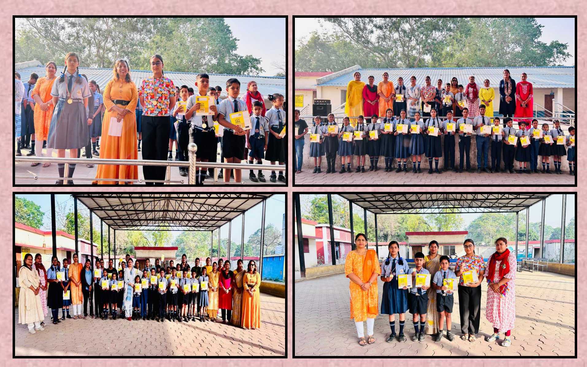
International English Olympiad(IEO) Certificates were distributed to participants